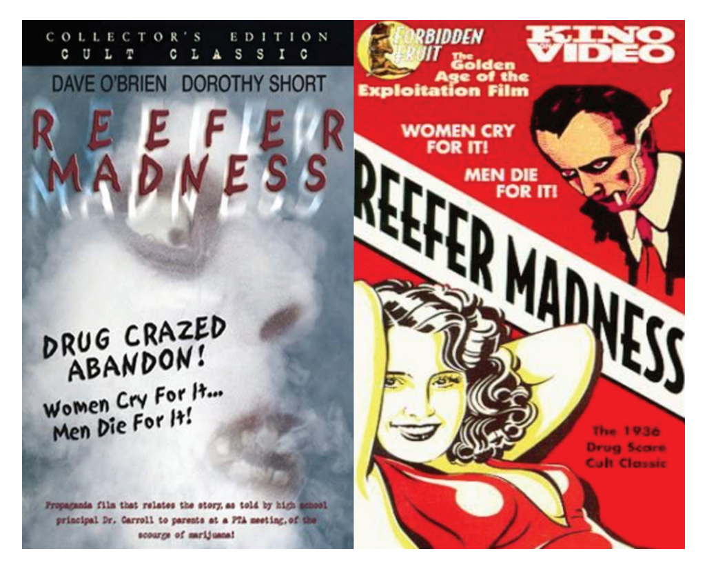
Figure 3. Imagery associated with cannabis use in the 1936 film Reefer Madness (67).

with zombie imagery (52). Frankenstein imagery was particularly potent based on the idea of scientific experimentation creating monsters rather than improving humanity (52). Empirical studies later evaluated people who use ecstasy negatively, arguing that ecstasy use is linked to crime and breaks down people's high selfcontrol to induce aggressiveness (76,77). Stories about monsters using drugs who go berserk and commit extreme acts of violence faced little challenge due to the "near-total chemical illiteracy of legislators and media personnel" (52).