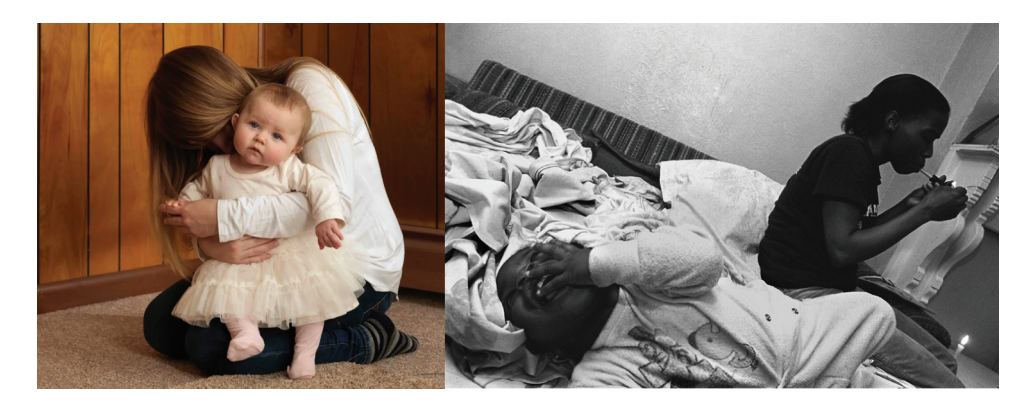
Figure 1. Media coverage of white mothers who use opioids (29) versus Black mothers who use crack cocaine (31).

Despite crack cocaine being portrayed as having strong addictive properties (37,38), the potency and psychoactive effects of crack cocaine were found to be similar to those of powder cocaine. Similar to the current position held by the National Institute on Drug Abuse (39), Hatsukami and Fischman (40) concluded that individuals who have a cocaine use disorder and "who are incarcerated for the sale or possession of cocaine are better served by treatment than prison" (40). Indeed, a series of U.S. Sentencing Commission reports renounced stereotypes perpetuated by the media-induced scare by stating that no studies have shown crack cocaine to render people more prone to committing violent crimes compared to powder cocaine (14,41–43).